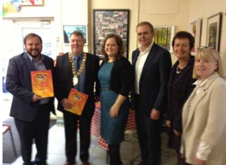
Top l-r: learners and staff with the new signage they created for the building in September; learners who received QQI certificates with special guest Conal Gallen.