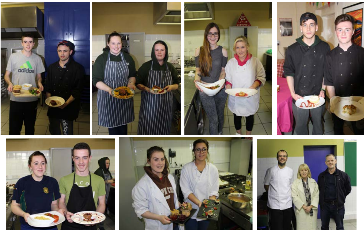
Top l-r: Team Letterkenny, Team Gortahork, Team Buncrana and Team Lifford.